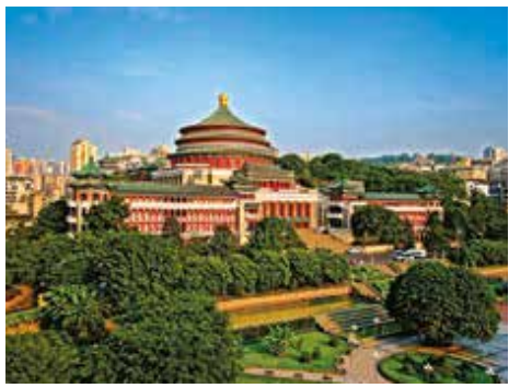
Great Hall of the People